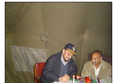
Chairman TPF signing MOU with AJK Health Department

The 4 units under our command are BHU Rerah, BHU Lohar Bela, Forward Health Post (FHP) Seri Gala, and FHP Samni. Cont'd on page 3