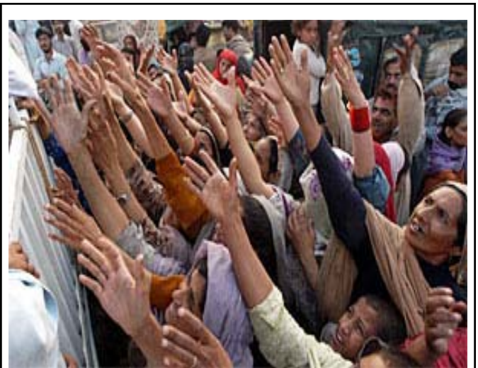
Victims of earthquake, trying to get some food.

Our initial objective was to provide relief in form of medical aid, food and tents to people affected by disaster in the selected villages around Rerah. Over 1500 tents, 4000