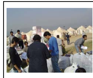
TPF Volunteers distributing gifts among children at Islamabad camp