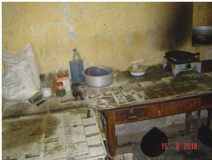
Kitchen facilities at management camp for our workers / volunteers