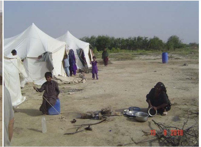
Women cooking food for lunch

We are maintaining stores of dry rations at our management camp which is located nearly a couple of kilometers from the relief camp. The IDPs are given a supply of food rations for 3 days, and every third day more rations are given to them according to the number of people staying at each tent. Proper registers are maintained of the residents, and joiners and leavers are recorded.