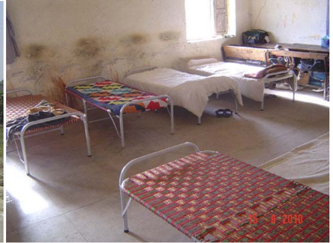
Beds for our volunteers/workers at management camp