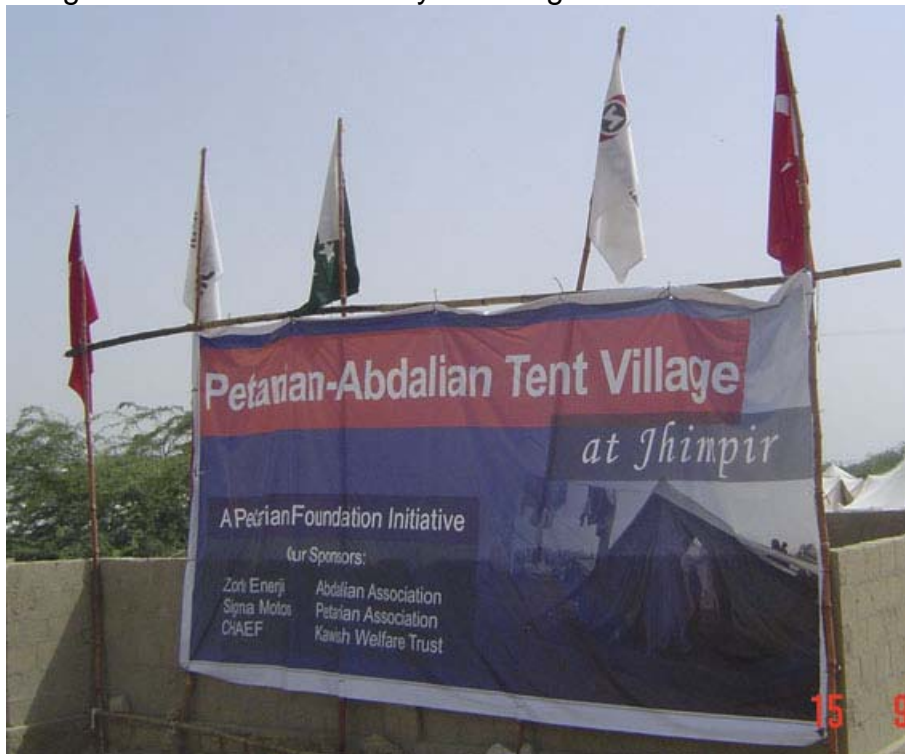
Main signboard at entrance of the Petarian-Abdalian Tent Village showing names of sponsors as well.

Our main camp is on the banks of the Kalri Lake. At the entrance you will find the following sign along with flags of Pakistan and Turkey fluttering above.