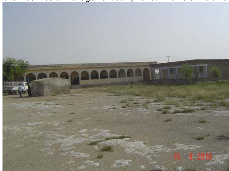
General view of Jhimpir School where our management camp/stores are located