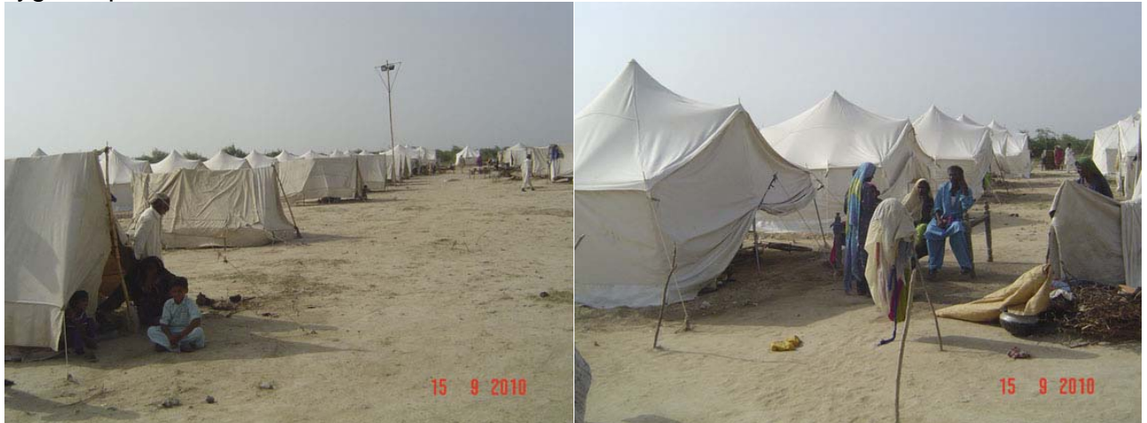
Some views of the camp

The camp area was first cleaned out for all bushes and shrubs and levelled before laying out all the tents in proper rows in a neat and clean manner. The camp managers have tried level best to ensure that the camp is clean with no garbage lying around that can cause hygiene problems.