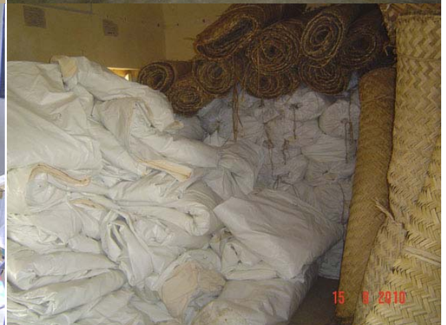
Food stores - rice, wheat flour, cooking oil, daal, etc.