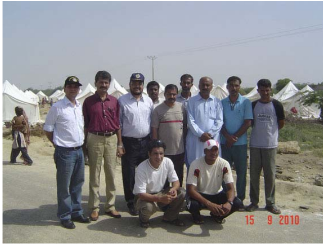
Some of our volunteers / workers at the camp

email: info@petarianfoundation.org , www.petarianfoundation.org